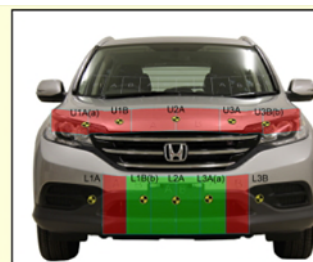
Adult leg impact (upper and full legforms)